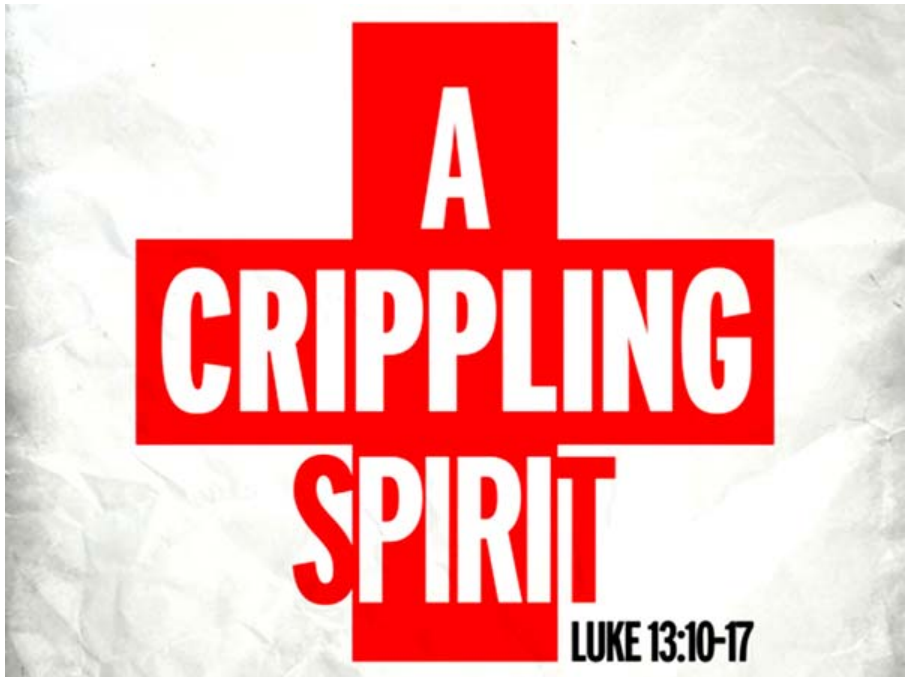
Today's theme for scripture and sermon

145 W. Church Ave. Covington, TN 38019 Office - 476-9694 www.covingtonfumc.com