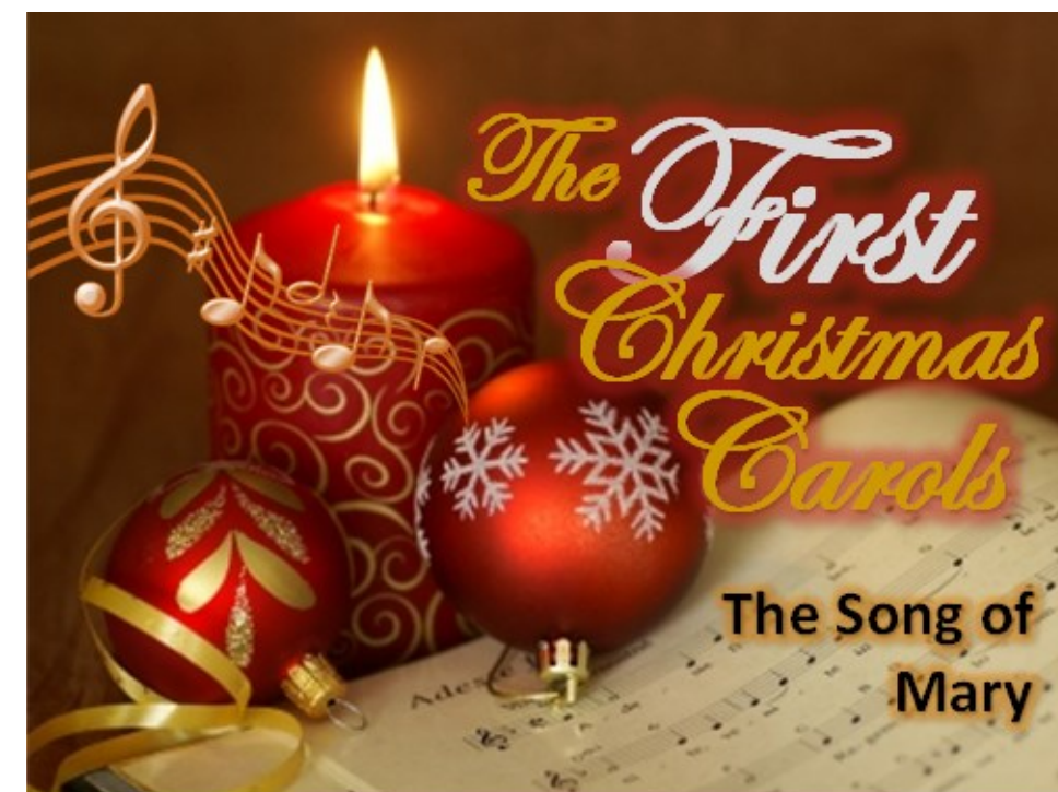
Today's theme for scripture and sermon