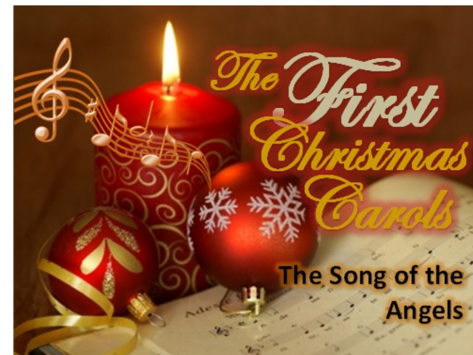
Today's theme for scripture and sermon