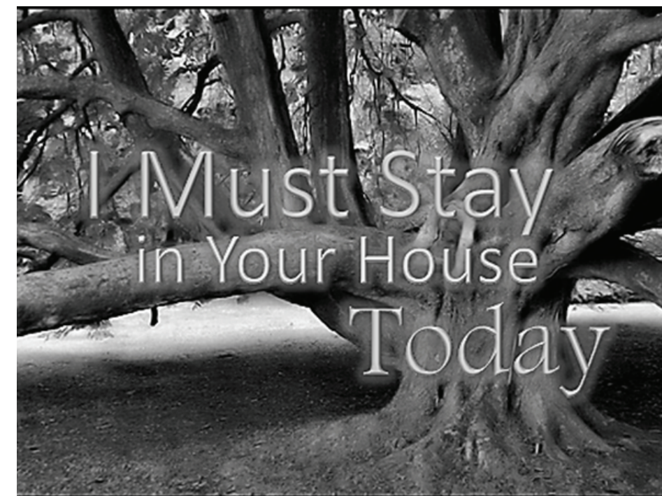
Today's theme for scripture and sermon