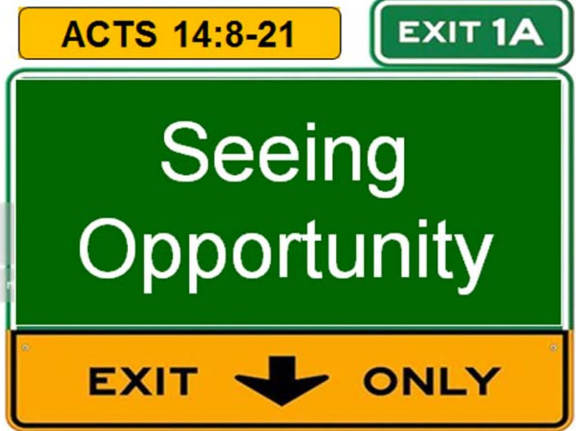
Today's theme for scripture and sermon

145 W. Church Ave. Covington, TN 38019 Office - 476-9694 www.covingtonfumc.com