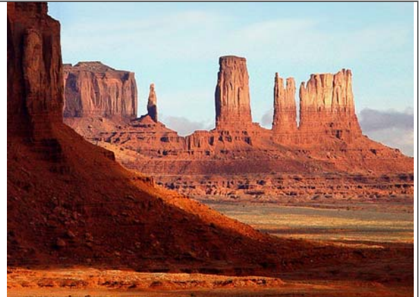
Monument Valley, AZ